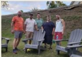
Men's bible study and barbeque.

Tuesday online English classes with LCMS volunteers teaching Puerto Rican students, just completed the semester on March 5th with an invitation to church events (not pictured).